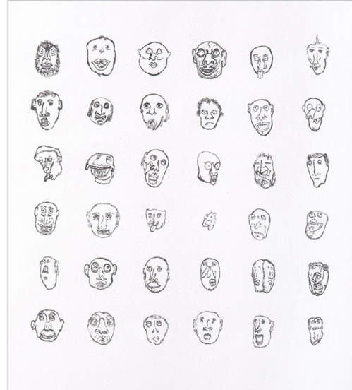
Left: Dianna Frid, NYT, Sept 1, 2019, BOBBY DILLON . Canvas, paper, embroidery floss, graphite, 2021. Courtesy of the artist. Right: Will Stovall, Untitled . Ink on paper, 2015. Courtesy of the artist.